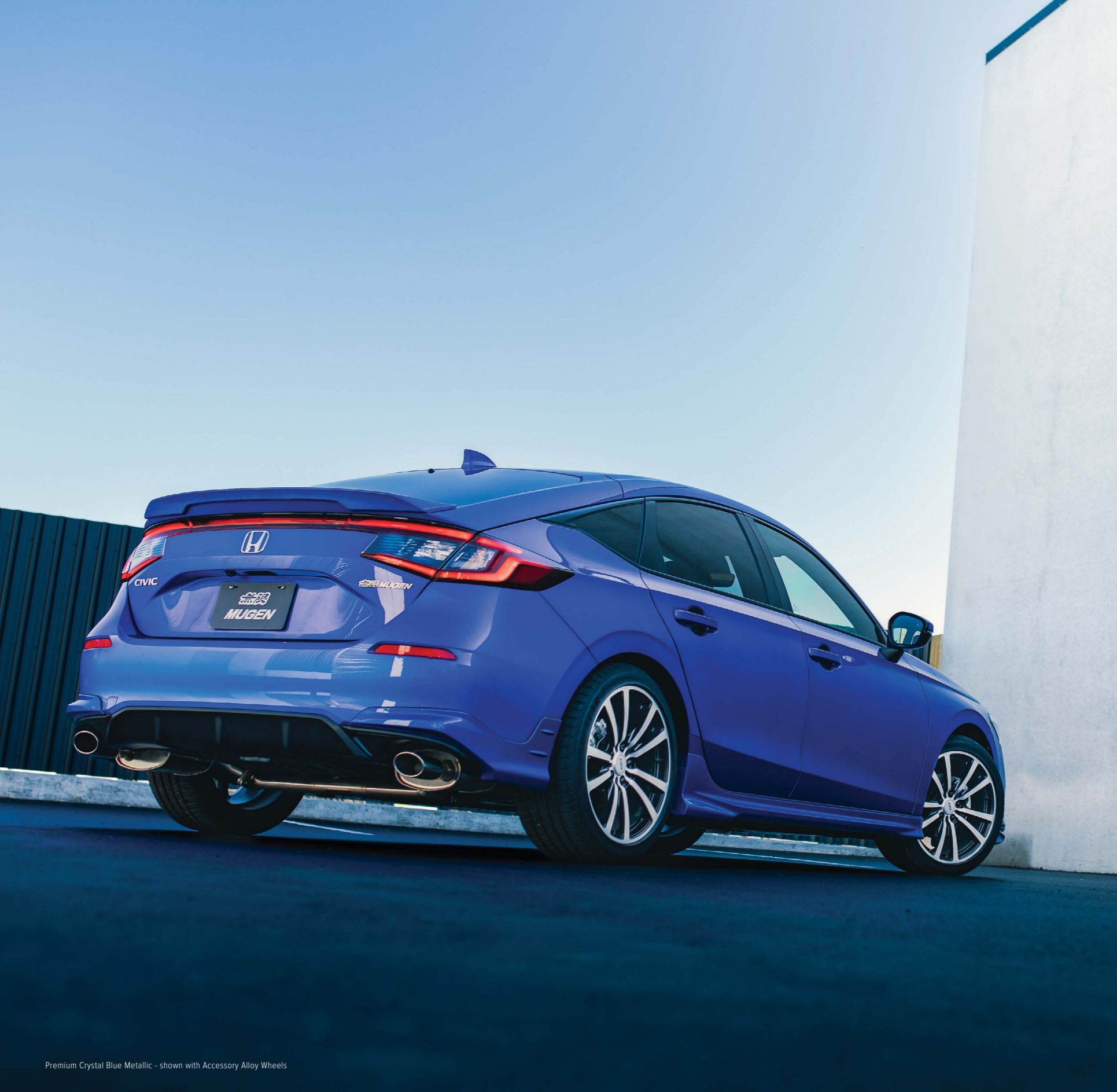
Premium Crystal Blue Metallic - shown with Accessory Alloy Wheels