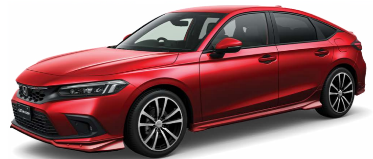
PREMIUM CRYSTAL RED METALLIC