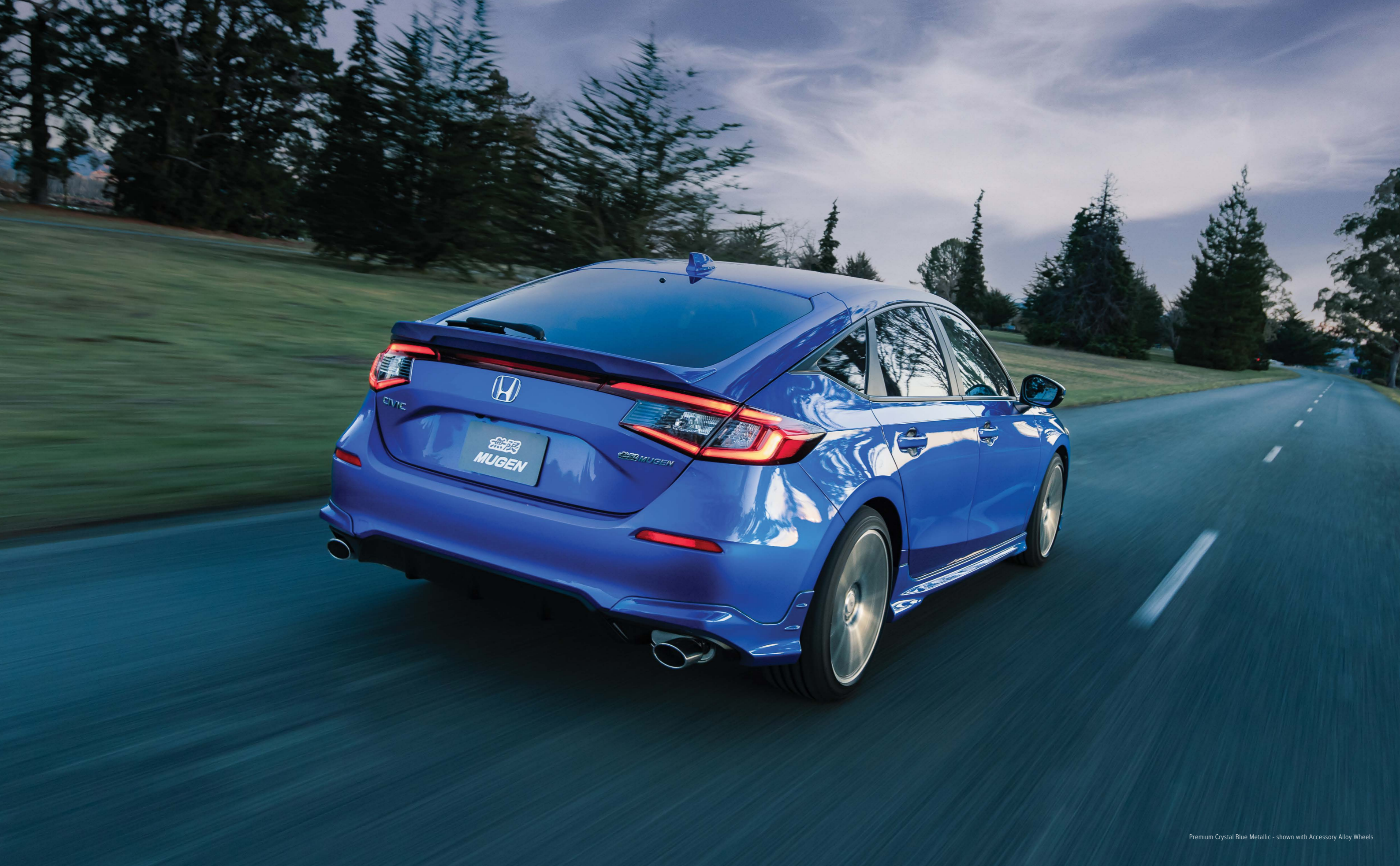
Premium Crystal Blue Metallic - shown with Accessory Alloy Wheels