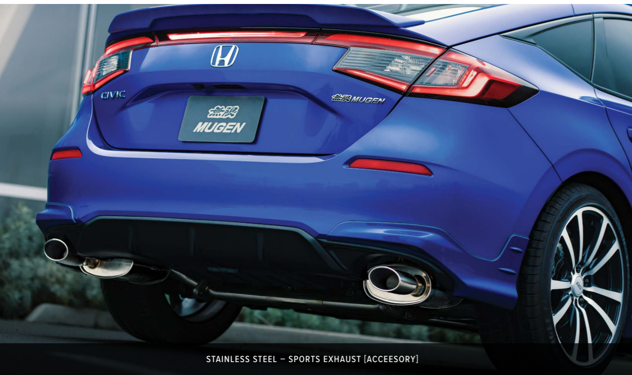
STAINLESS STEEL – SPORTS EXHAUST [ACCESORY]

The sports exhaust system has been designed to produce a deep and mature tone which compliments the VTEC TURBO powertrain perfectly. The stainless steel construction helps realise high efficiency and performance. The system consists of a centre resonator and dual mufflers, with dedicated garnish trims. Each muffler adopts an oval finisher, amplifying the sporty nature of the Civic and in homage to the famous MUGEN tuner systems of the past.