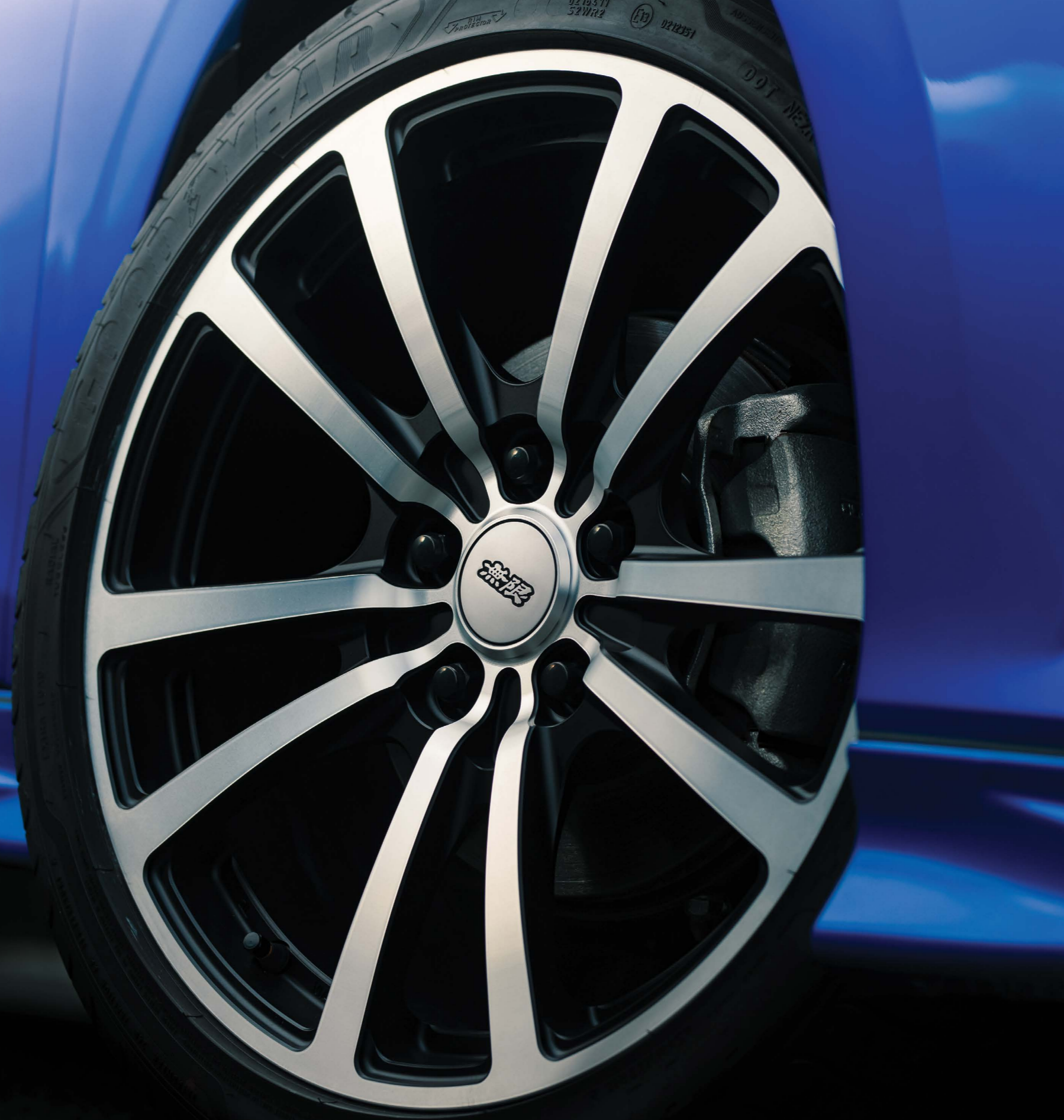
FORGED ALLUMINUM – FS10 WHEELS [ACCESORY]