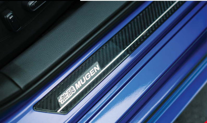
CARBON EFFECT – DOOR SILL GARNISHS