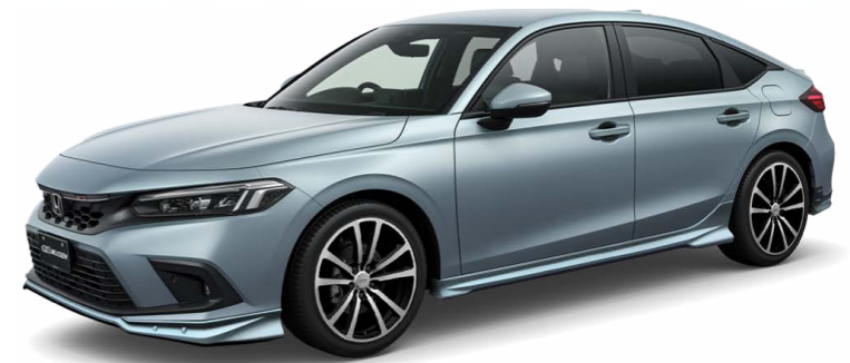
SONIC GREY PEARL