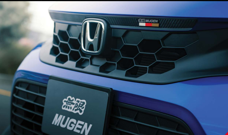
CARBON EFFECT – GRILLE TRIM