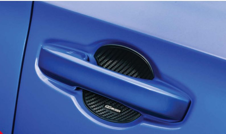
CARBON EFFECT – DOOR HANDLE PROTECTORS