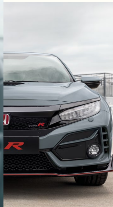
SONIC GREY PEARL INDENT STOCK ONLY