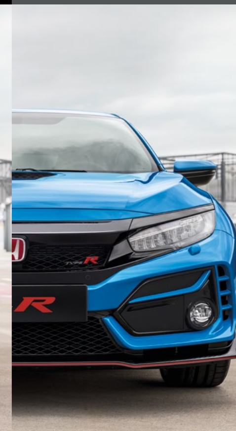
BOOST BLUE PEARL