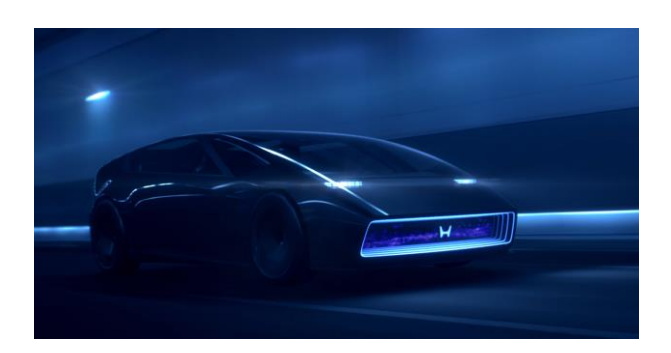
Saloon concept movie https://www.youtube.com/watch?v=87qnsLic5hw

With the adoption of steer-by-wire and the further advancement of the motion management system, including posture control, that Honda has amassed through the development of original robotics technologies, the Saloon aims to realize control at the will of the driver in a variety of driving situations. As the flagship model of the Honda 0 Series, the Saloon pursues the ultimate "joy of driving" in the EV era. Furthermore, including the use of sustainable materials for the interior and exterior, the Saloon is being developed as a unique model that resonates with users and the natural environment.