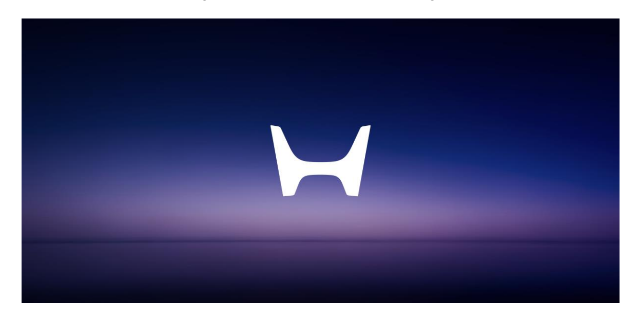
Honda press conference at CES 2024 (livestreaming/archive) https://www.youtube.com/watch?v=jYdfi_zkQDQ

The current "H mark" has a long history, dating back to 1981 when it was renewed from the previous version. To commemorate the development of the next-generation EVs, Honda decided to design a new H mark, which represents Honda automobiles, to express Honda's determination to pursue the transformation as well as Honda's corporate attitude of going beyond the origin of Honda and constantly pursuing new challenges and advancements. This design expression, like two outstretched hands, represents Honda's commitment to augment the possibilities of mobility and sincerely serve the needs of the users of Honda EVs. This new H mark will be used on next-generation EVs of Honda, including Honda 0 Series models.