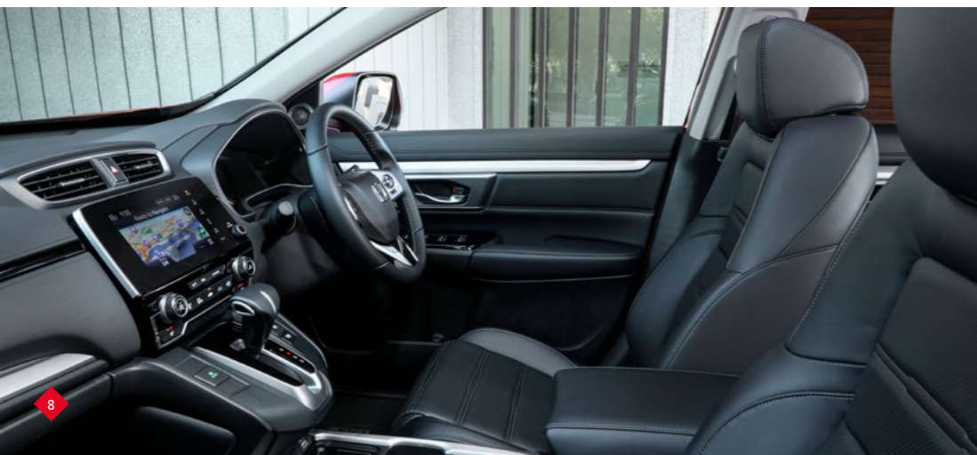
CR-V Sport Premium Shown in Ignite Red