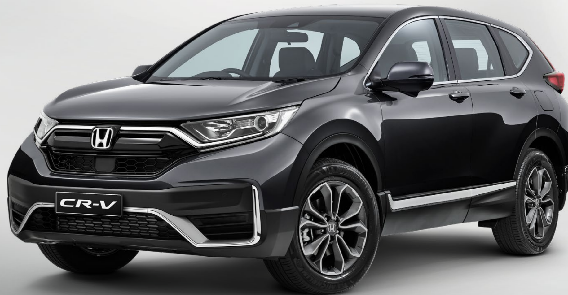
CR-V Touring Shown in Meteoroid Grey Metallic