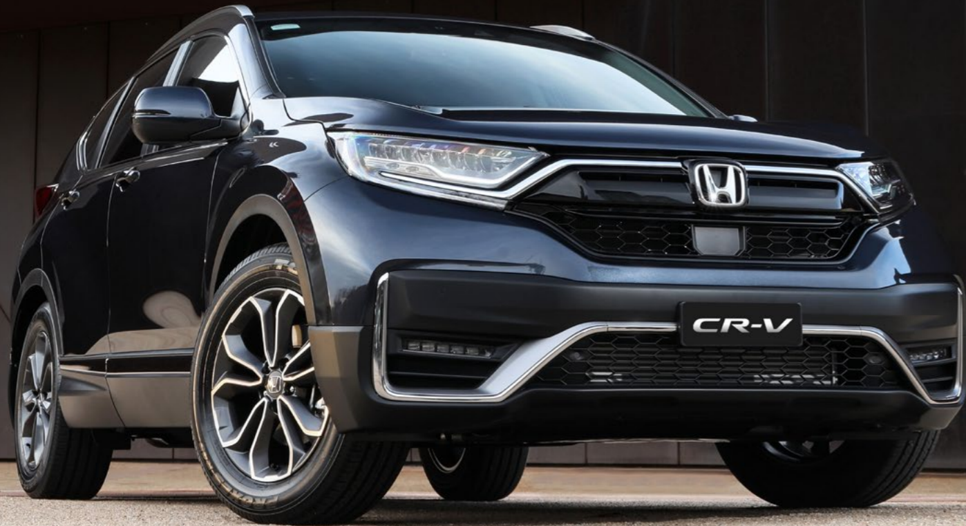
Model shown is the CR-V Sport 7 in Cosmic Blue