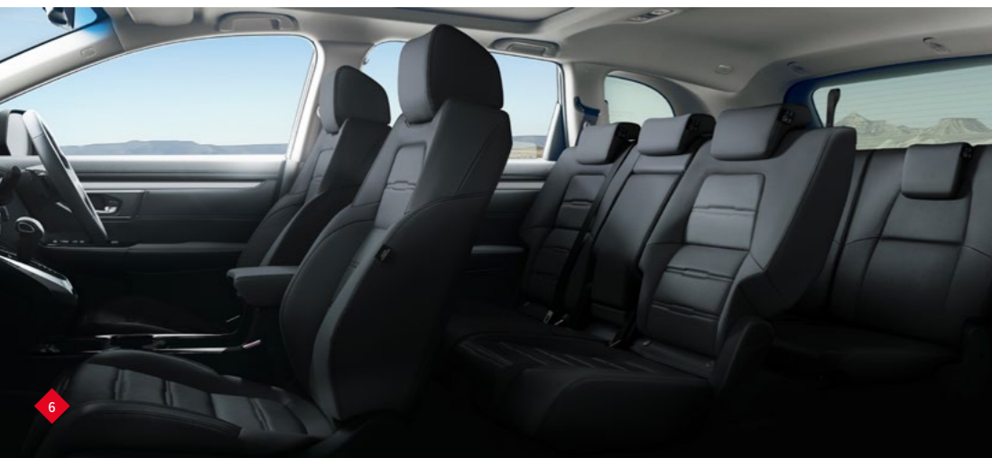
CR-V Sport 7 Shown in Cosmic Blue