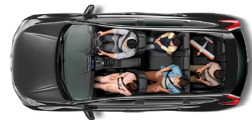
7 SEAT MODEL SHOWN