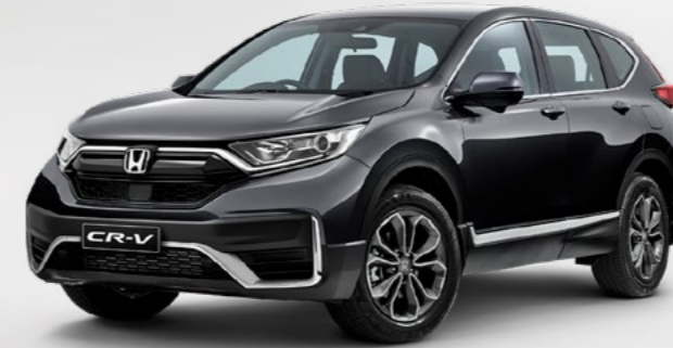
METEOROID GREY METALLIC