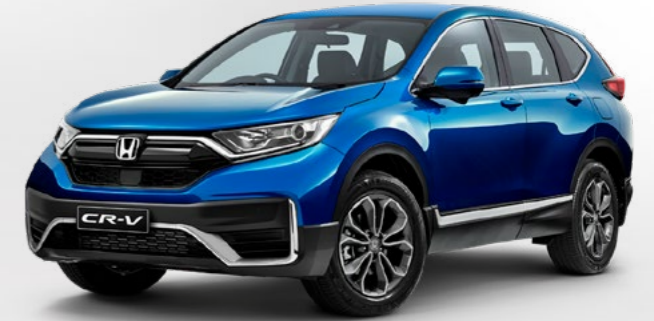
BRILLIANT SPORTY BLUE METALLIC